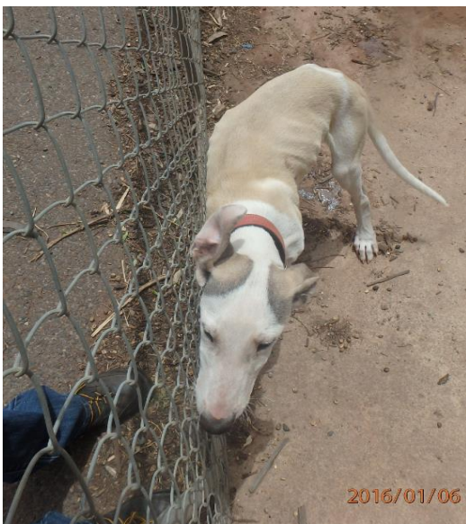
Dog left without sufficient food and water.