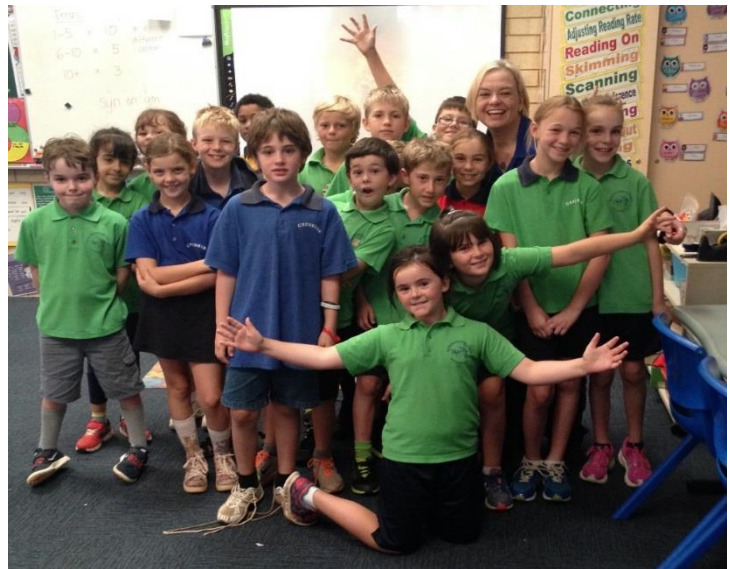
RSPCA school program at Hannans Primary School.