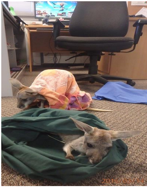
Two joeys chased by children. Now in foster care to recover and be released.