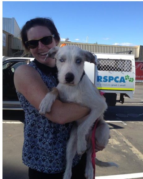
Rescued deaf dog from hot car at Kalgoorlie Regional Hospital carpark, now adopted by new owner.