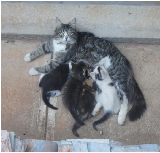
Abandoned cat and kittens - West Lamington. Two animals adopted, others in foster care.