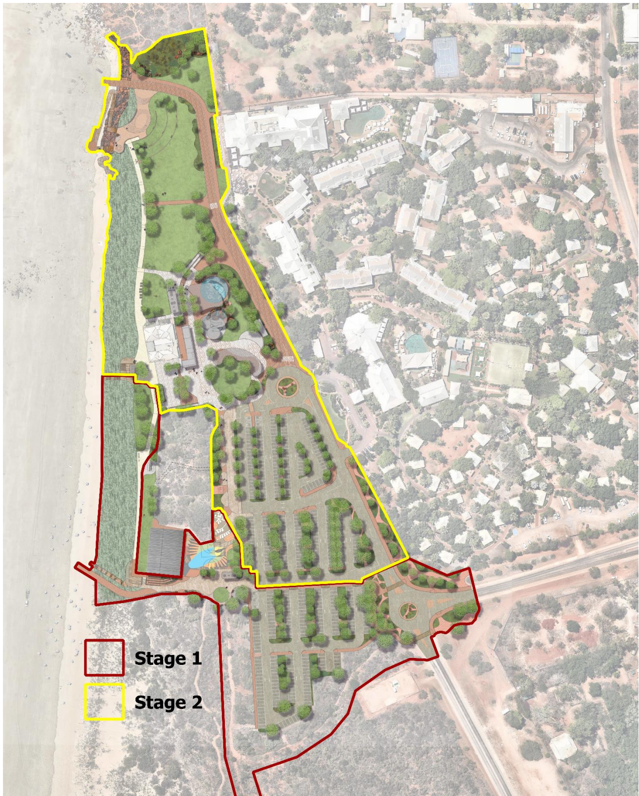
Figure 1 Construction Stages of the Walmanyjun Cable Beach Foreshore Redevelopment.

Since the estimation of costings in 2023, the Shire has actively sought grant funding to support delivery.